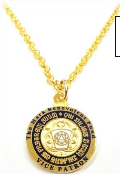
Ladies Vice-Patron worn as a Pendant