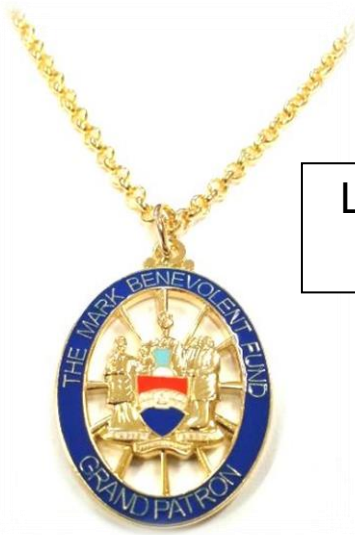
Ladies Grand Patron worn as a Pendant