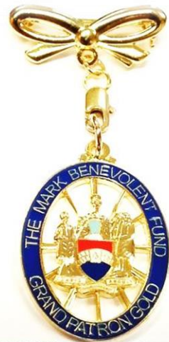
Ladies Grand Patron Gold worn as a Brooch