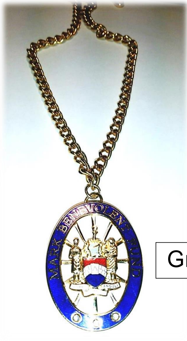
Grand Patron Diamond