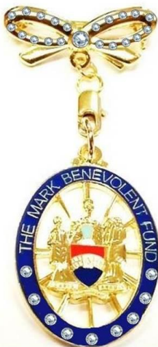
Ladies Grand Patron Diamond